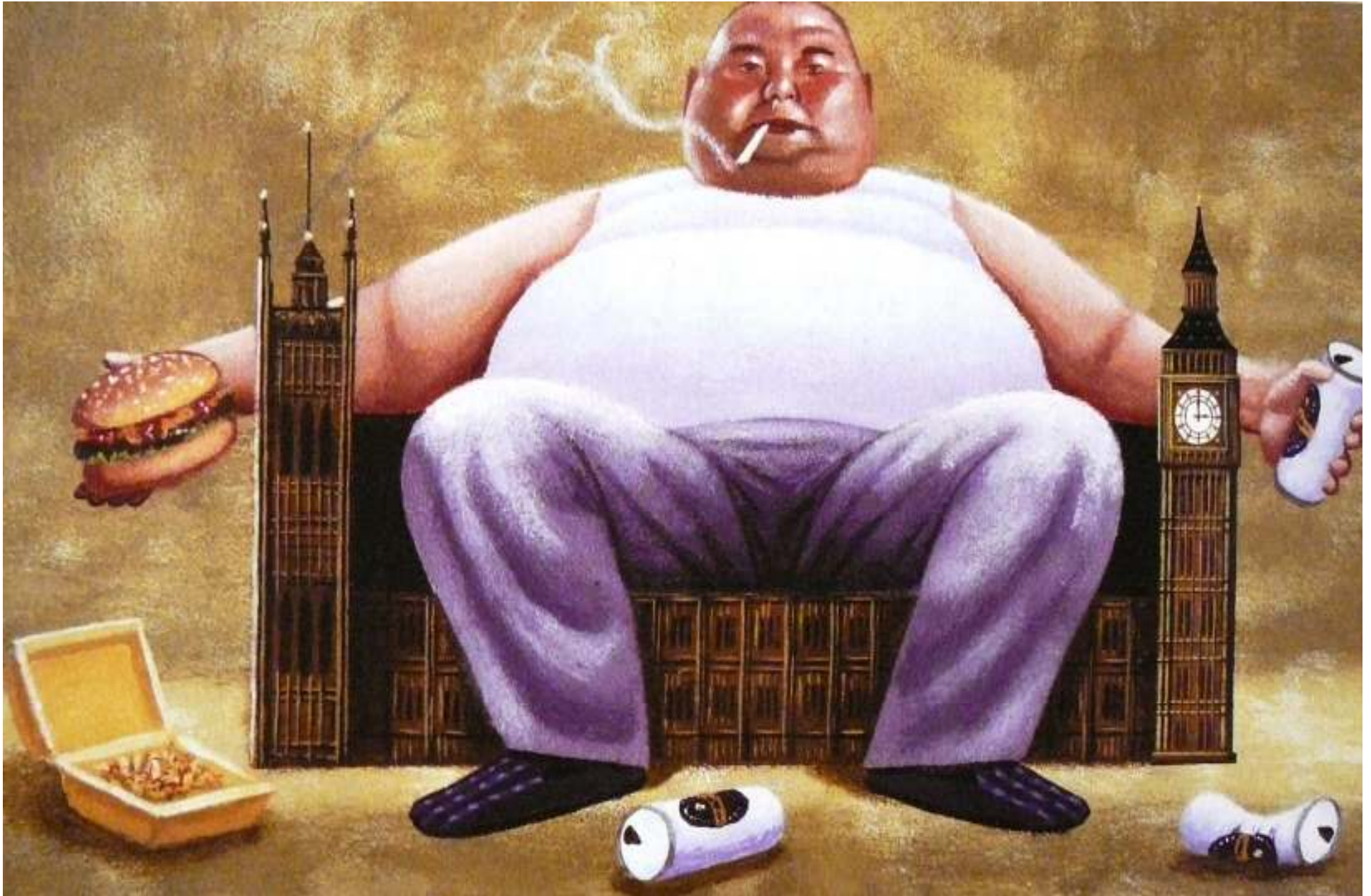
The Spectator: obesity policy